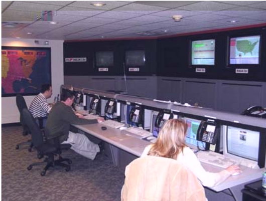
One of the NOCs in the USA

Our network is extremely robust and well managed. The network is served by Network Operations Centers (NOCs) based at four teleports in the USA and Europe. These are staffed by highly experienced specialists 24 hours a day, every day. Every part of the network is interconnected by dedicated DS3 high speed internet connections and redundant connections to the Internet. This means that if any single NOC becomes unavailable, its functions can be immediately and fully assumed by one of the other NOCs. Power supplies are also fully redundant with multiple generators and fuel available for at least 100 hours operation independent of national power grids. This is the infrastructure which ensures reliability and through which excellent service is delivered.