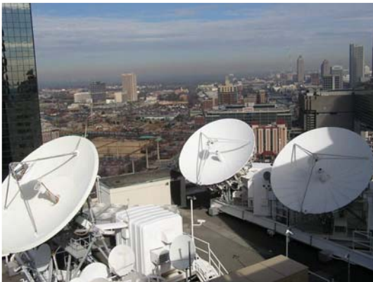
One of the teleports in the USA